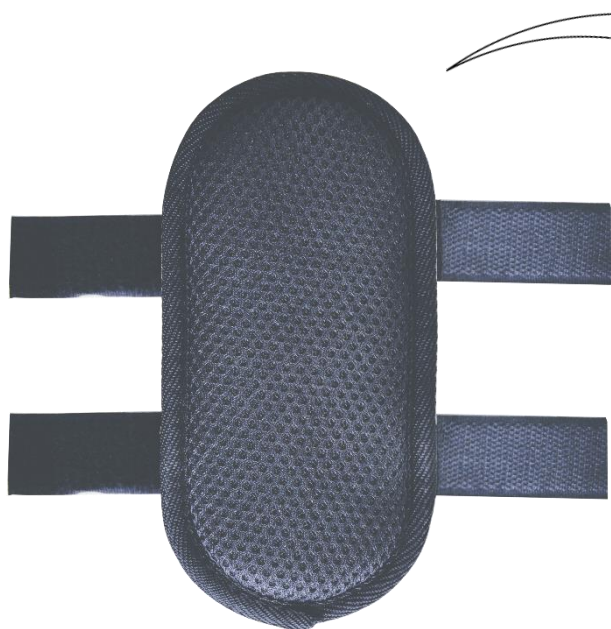
Protection d'épaule amovible Removable shoulder pad Protección de hombros extraíble Protezione spalla amovibile Abnehmbarer Schulterschutz